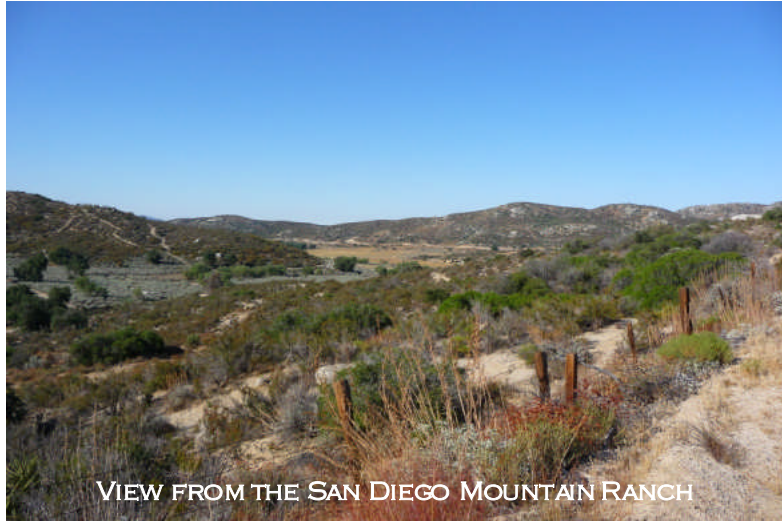
VIEW FROM THE SAN DIEGO MOUNTAIN RANCH